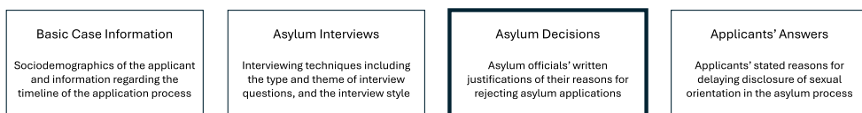
FIGURE 2 Structure of the coding scheme.

decision-making patterns – the focus of this study – we coded the official's justifications given to either support or undermine the credibility of the claim. A discrete justification was defined as a unit of information within the credibility assessment, which referred to a thematic aspect of the applicant's story, whether that thematic aspect was deemed credible or not, and the credibility indicators cited by the official. For example, 'Your account of your sexual identity development [theme] was not found to be believable [credibility judgment] because it lacked sufficient detail [indicator]'. For each asylum decision, we also coded whether the applicant's SOGI in its entirety was found credible and whether the fear of persecution was considered well-founded. Finally, we coded whether the credibility of the claim was accepted entirely (all material facts found credible), rejected entirely (no facts found credible), or partially accepted (a combination of facts found credible and not credible). For example, the credibility of a case could be partially accepted if the official found the applicant's claim of harm at the hands of armed militia credible but rejected their claim that their family had discovered their sexual orientation.