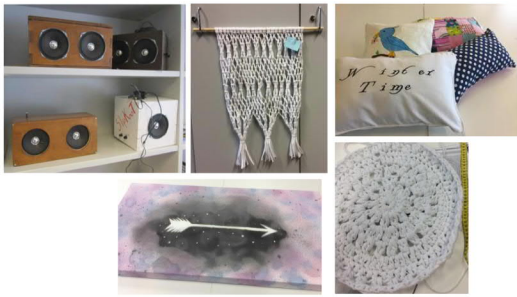
Figure 2: The final products of students in TCC and HDC were creative and unique.

The students were asked if they would like to display their final products in the social environment. It was clear that the students in the CC course were the most unwilling to show their products to people outside the course to avoid social risk. In the TCC and HDC course, social risks were not avoided; instead, students were pleased to take social risks and display their products. The majority of these students were satisfied with their final products and wanted other people to see what they had done.