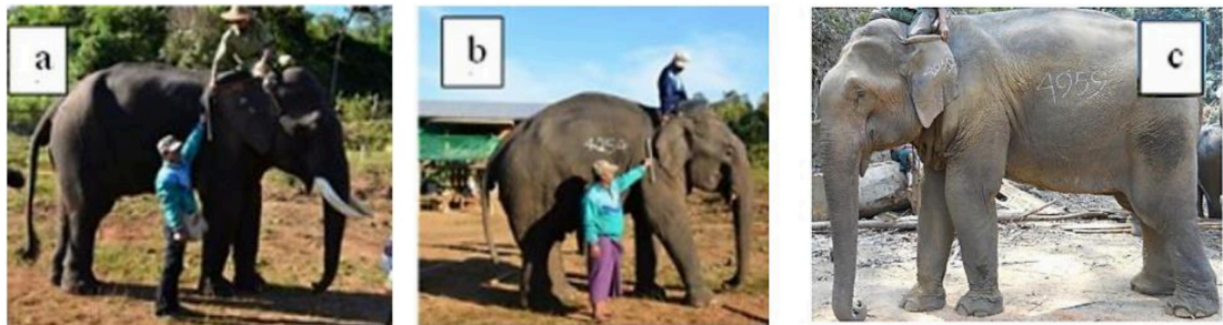
Figure 1. Phenotypic variation in tusk expression in the study population: pictures from Myanmar timber elephants: (a) a 45-year-old long-tusk male; (b) a 42-year-old short-tusk male; and (c) a 37-year-old tuskless male.

We formulated two hypotheses. First, given that most of the tusk growth may occur outside musth and because examples in the ibex and mouflon showed more horn growth when testosterone levels are low [29–31], we expect that long-tusk males would exhibit lower testosterone levels than their short-tusked peers. Second, because testosterone is often linked to a more aggressive personality, we expect long-tusk males to have less aggressive and more social personalities than short-tusk males.