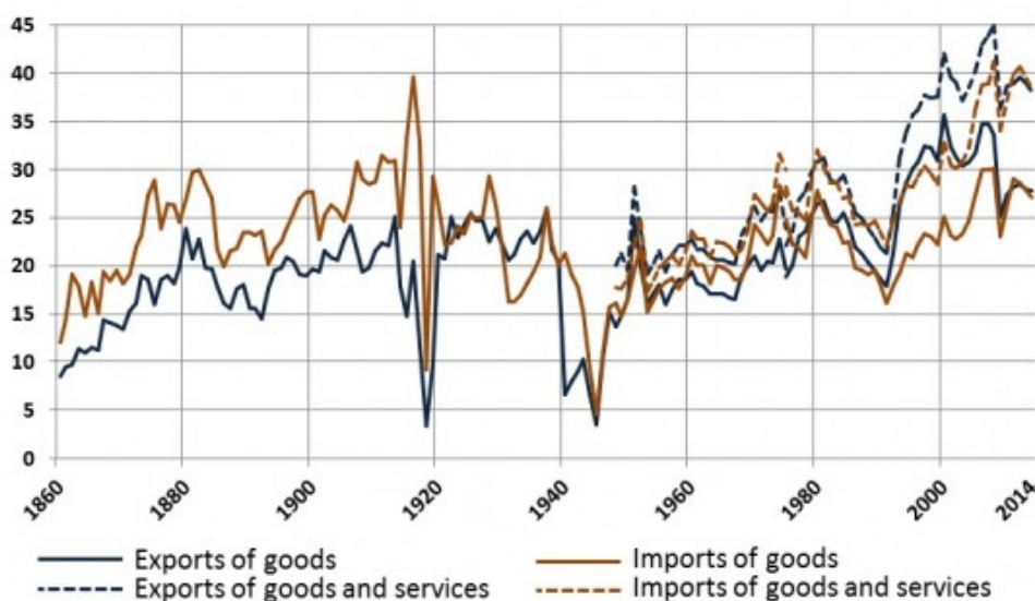
Table 1. Finnish Foreign Trade, 1860–2014, per cent to GDP

Sources: Riitta Hjerpe, Finland's Historical National Accounts, 1860–1994 (1996); Reino Airikkala & Tuomas Sukselainen (ed.), Suomen maksutaseen kehityslinjat vuosina 1950–1974 (1976); Jarmo Kariluoto, Suomen maksutase (...) 1975–92 (1995); Suomen Pankki, Suomen maksutase 1993–2002 (2003); Tilastokeskuksen PX-Web-tietokannat, http://pxnet2.stat.fi/PXWeb/pxweb/fi/StatFin/ (25.12.2015)