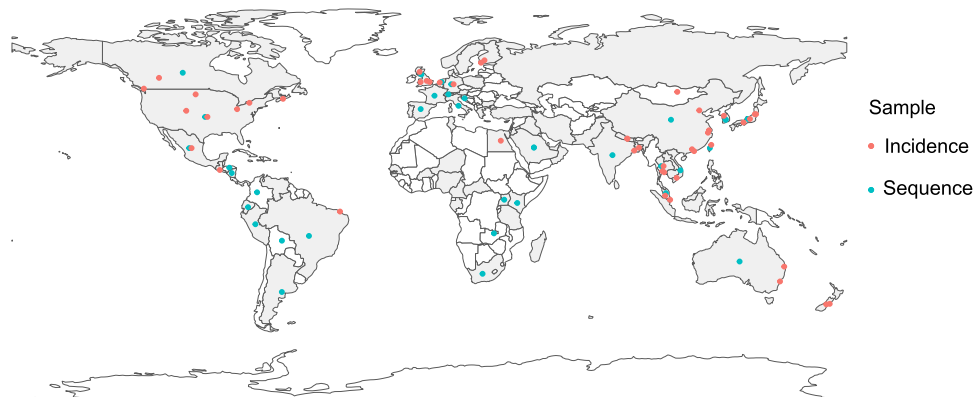
Fig. 1. Map of study sites with incidence and sequence data of human parainfluenza viruses. Geographic regions with incidence data are filled in grey. Study sites with incidence and sequence sample sites are indicated by red and blue dots, respectively.

The geographic overview of all samples included in this study is shown in Fig. 1 (and detailed in Supplementary Table 1). Among these, hPIV detection rates from 421 cross-sectional studies from 77 countries/regions are summarized in Table 1. The median positive hPIV detection rate among symptomatic patients was 5.46% (IQR: 3.14–8.69%), and the positive rates for types 1–4 were 1.42%, 0.69%, 3.48%, and 1.19%, respectively (Table 1). The overall positive rate of hPIV in children (under 18 years) was 6.45%, which was significantly higher than that in adults (4.34%, p < 0.001 ). No significant difference was found between the positive rates in the age groups 0–6 and 7–18 years (Supplementary Figure 1). Differences in positive rates between children and adults were only significant with hPIV1