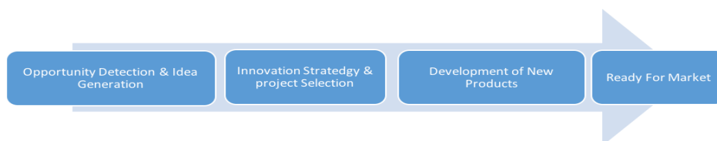
Figure 3. Innovation value chain

The Open Lab in Stockholm, Sweden is a center where students, teachers and researchers from Karolinska Institutet, KTH, Stockholm University and Södertörn University are working on challenges of the different application of the area. The aim is to contribute to solutions for complex social issues for the growing region through new interdisciplinary cooperation between traditional knowledge areas. The vision is that Open Lab, in a few years' time, will be counted as one of the most innovative and attentive interdisciplinary environments in Europe, and which greatly contributes to placing Stockholm ahead of the development of knowledge about how to contribute solutions to meet the growing and sustainable city's challenges. The largest number of Maker space members in Sweden are working in the open place on 300 m 2 large local area in Stockholm[8]. The Maker space is often hosted by open evenings with lectures and workshops. Continuous operations are currently funded mainly through membership fees, while contributions from sponsors go to improve business.