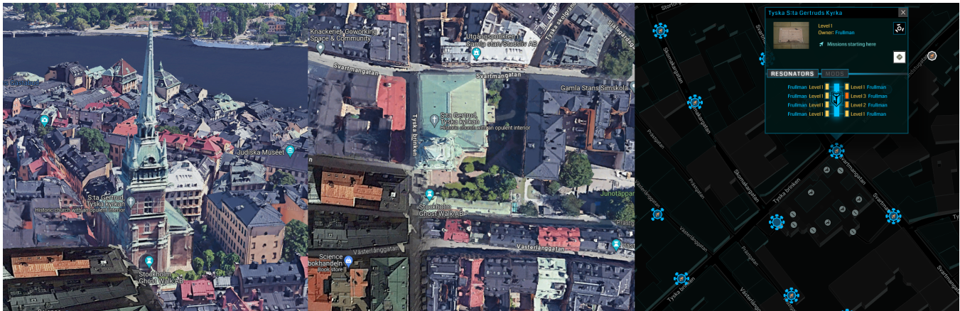
Figure 2: We display three screenshots side-by-side taken by the authors which represent the Lutheran German Church (Tyska Kyrka) in Stockholm, Sweden. On the left is a screenshot of Google Maps using the satellite view layer and tilting the view to display textured models of the real world buildings. On the center likewise a screenshot from Google Maps but with a non-tilted (top-down) view. On the right is a screenshot of the Church in Niantic’s location-based game Ingress Prime.

and sacred spaces. This draft was sent to two experts on religion for review. These two experts (a professor in theology and an IT professor who was also an ordained priest) offered multiple comments and improvement suggestions to the survey structure, based on which the survey was refined – e.g., we dropped quantitative questions and focused only on open ended questions. The question designs were motivated by the researchers’ initial observations of potential conflicts that location-based AR might already have with sacred spaces i.e. battles on top of sacred grounds (see Fig 1) and adding magical creatures with connections to a religion (e.g. Shintoism [18]) inside the sacred places of another religion. We did not want to lead the participants towards any specific view or thought pattern, and hence, the questions were intentionally kept broad. The final survey questions (excluding demographic questions) are displayed in Table 3. One limitation we notice here, however, is that questions #4 and #5 are negatively valenced, leading the participants perhaps to think more of negative aspects rather than positive.