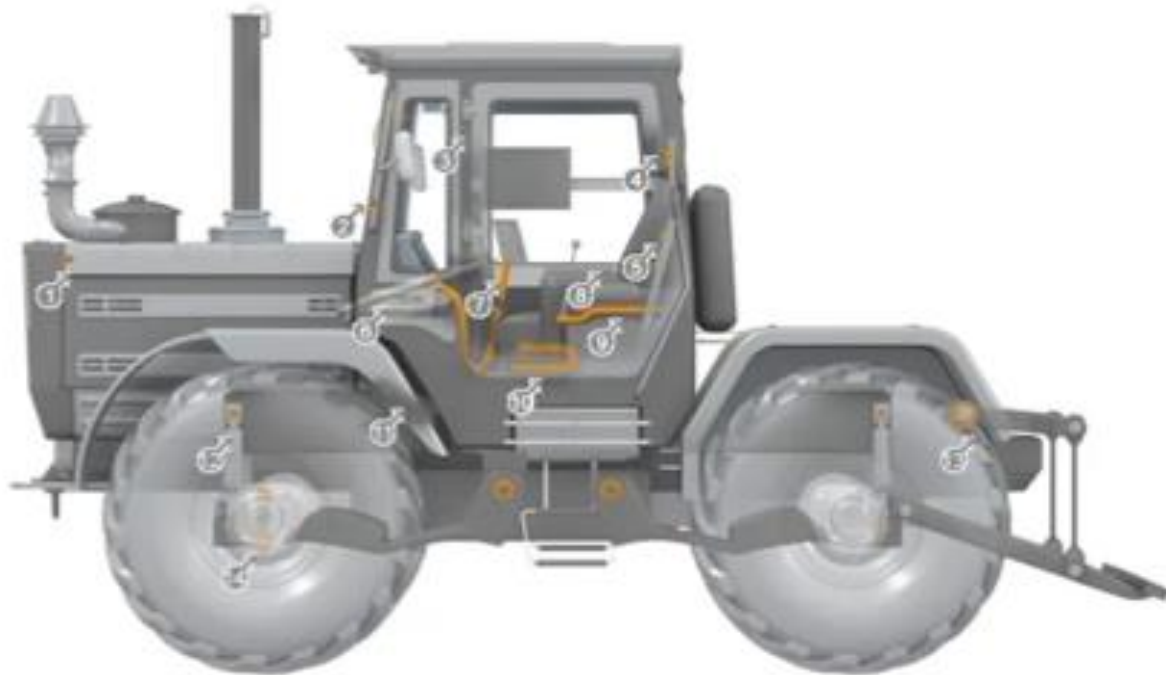
Figure 1. Application points of polymer plain bearings in a tractor assembly.

On-road vehicles have bearings in suspension components, engines, transmissions, drivetrains and steering components [2]. Heavy-duty off-road equipment has auxiliary motions specific to that equipment in addition to the same general components [2]. For example, an agricultural combine harvester has many mechanical functions in its grain threshing system, and earthmoving machinery has mechanical and hydraulic front loader buckets and excavators, all of which require multiple bearings to ensure frictionless, mechanical motion and smooth operation [2]. Table 1 shows where plain bearings are found in agricultural equipment.