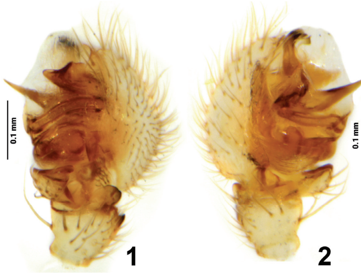
Figs 1–2. Male palp of Atypena cirrifrons . 1– lateral view; 2 – retrolateral view.