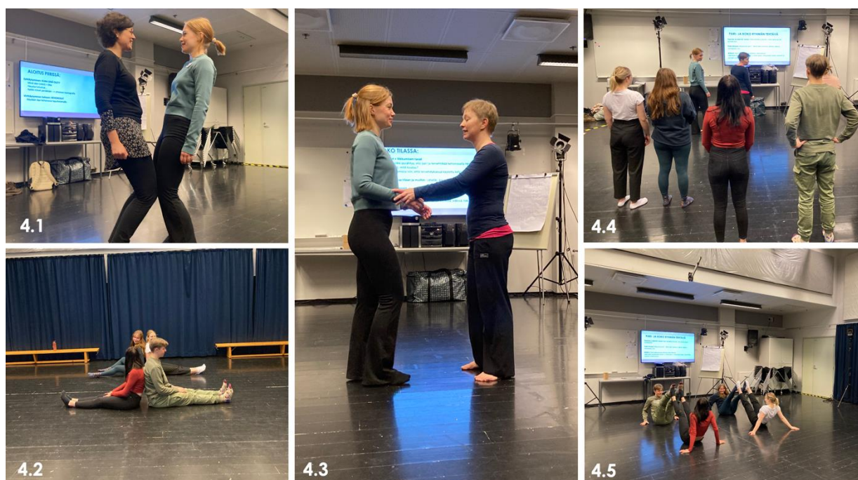
Figure 4. Examples of activities from workshop III

how are you?]; example 4.1); changing positions and relations on clap (e.g., ylhäällä-alhaalla [up-down]), and enacting a movement composition on spatial relations (e.g., olen edessä , [I am in front of you]; example 4.3–4.4). The following creative, task-based activities built upon the verbal elements of the previous exercises and involved creating movement compositions (examples 4.2 and 4.5), photographs, and group statues with theme-related verbal phrases. To end, the becoming-teachers discussed their experiences of the workshop, which combined practical and theoretical perspectives on dance in additional language learning contexts.