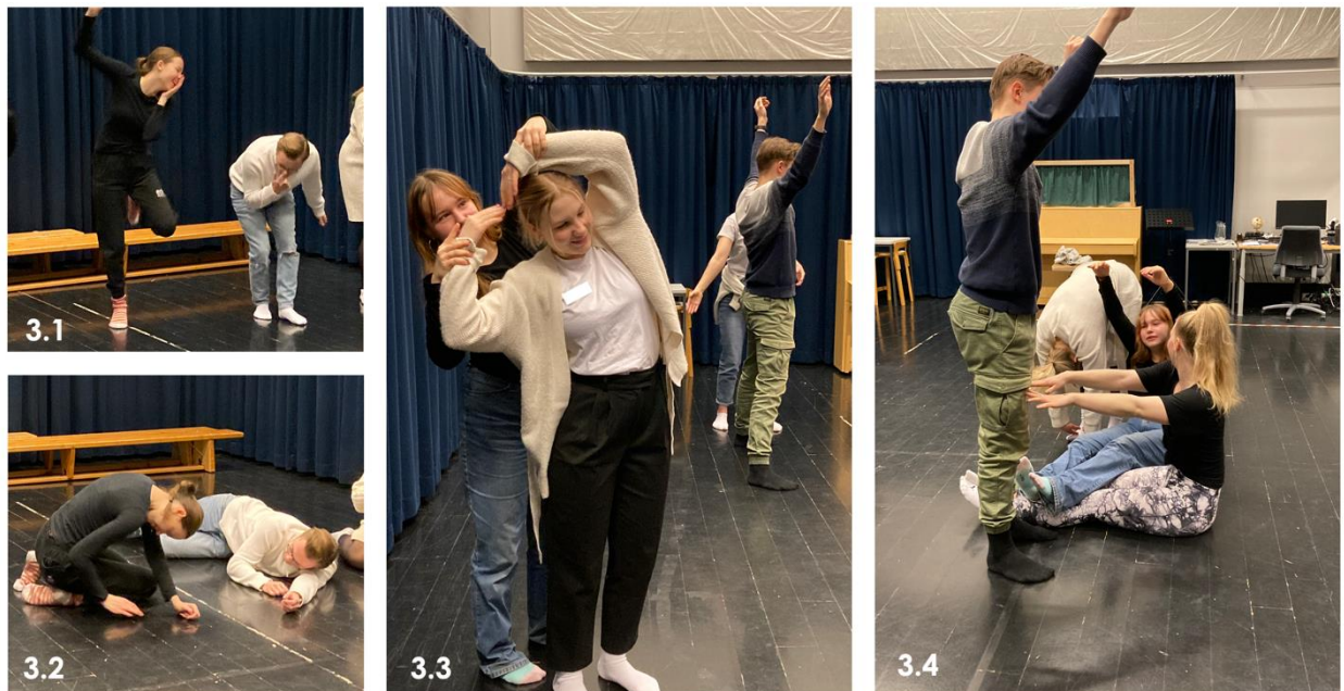
Figure 3. Examples of activities from workshop II

Workshop II focused on integrating dancing and early literacy, building on activities that Sofia had implemented with six-year-olds within another ELLA subproject, together with a dance teacher and a pre-primary schoolteacher 4 . Figure 3 presents examples of some of these activities (examples 3.1–3.4). The first part included various practical activities. The warm-up exercise involved everyone introducing themselves and proposing a movement or statue pose for the first letter of their name and creating an alphabet chain through movements and statues in groups (example 3.4). Next, the becoming-teachers created letter statues with one becoming-teacher as “the artist” and another as “the clay” (example 3.3). After, they improvised movements to letter sounds and words beginning with that letter (e.g., e and elefant [elephant]) and listened for sounds and wrote letters being danced by others. Finally, they created and performed a group choreography based on words that rhyme (e.g., katt, hatt [cat, hat]; examples 3.1–3.2). The second part included discussions about the experiences of participating in the workshop, interwoven with a theoretical discussion about arts integration in literacy education.