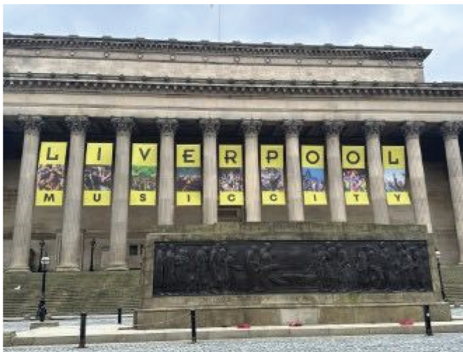
Figure 1. Liverpool, UNESCO city of music, proclaims itself to be a city of music via a banner on the city's St. George's Hall, may 2024.

Meanwhile the UNESCO City of Music process began in 2006 and as of 2024, there 75 UNESCO Cities of Music. 5 They form part of the broader Creative Cities network which was established in 2004 and now has 350 members. These cities come from more diverse geographical locations than the