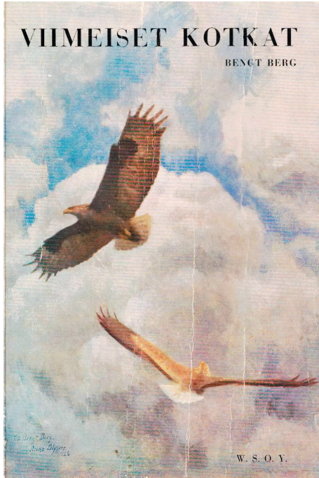
Figure 6.1: The front cover of the Finnish edition of Bengt Berg's book Sagan om de sista örnarna (1923). The Finnish translation was published in 1930.

increasing human impact on wildlife after the Second World War and the accumulation of environmental toxins on the birds of prey at the top of the food chain. The situation was particularly serious in the 1970s, when conservation efforts were stepped up by increasing winter feeding of white-tailed eagles, building artificial nesting sites and protecting nesting areas from logging. 9