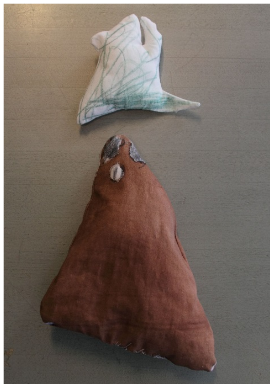
Figure 7: Poo with his stink made by Willy.