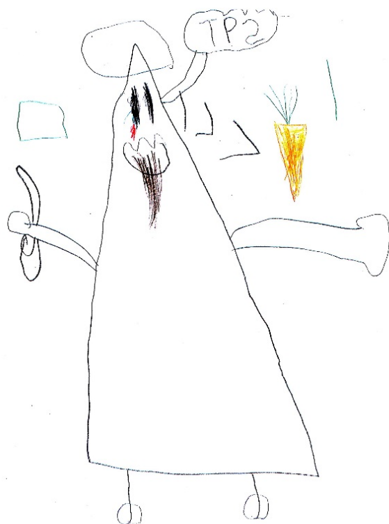
Figure 4: John's sketch of a funny character, whose shape is based on a mountain and who is a fan of hockey league TPS (TPS is a hockey team in a neighbouring city). He likes eating carrots.

During the fourth day, the children filled their fabric characters with cotton wool and sewed them together by hand. The children were then asked to add details (e.g. pearls, buttons and strings). On the fifth day, when the soft toy was ready, the children were asked to tell a story about it. It was emphasized to them that the story could be anything as long as it involved the character. Because most preschoolers were not yet able to write, we facilitated the stories using the story-crafting method (see Figure 1), a process in which a child or a group of children acts as the narrator, and a story crafter writes the story down word for word. When the story is finished, the story crafter reads it to the narrator to offer him or her the opportunity to change the text. The stories are also often read aloud to others and collected (Karlsson, 2009). After the storytelling, the soft toys and their stories were presented to the whole preschool group.