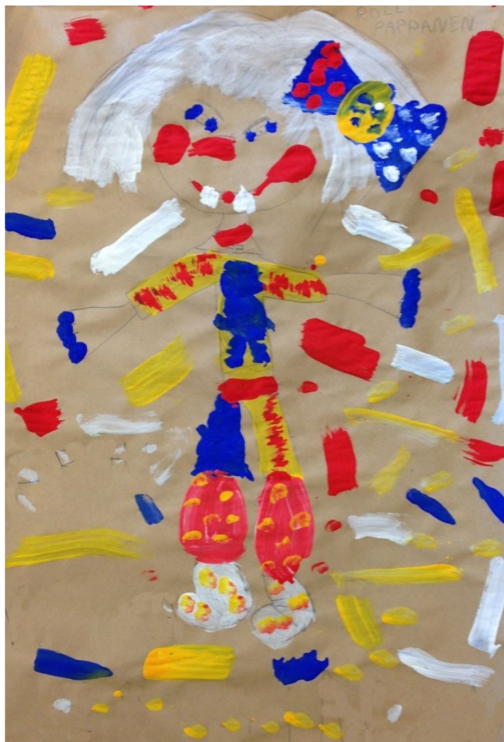
Figure 3: A collaborative sketch of a character called “Röllli Pappanen” (Röllli is an imaginary troll fairytale character in a TV series).

The second day started with the children and the researcher becoming acquainted with individual drawings and talking about sense of humour. Thereafter, the children were asked to collaboratively draw a character that would make others laugh, in accordance with the original instruction of Piret (1941) (see Figure 1). One example of these collaborative drawings is shown in Figure 3.