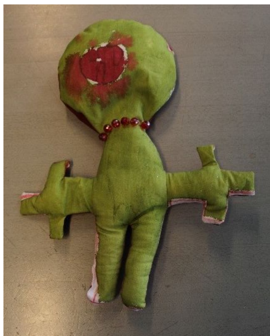
Figure 5: Billy's soft toy called Super-four.

The humorous features of the soft toys were associated with various situations and combinations, and were added especially to the clothes, accessories and features (e.g. facial expression, hair and makeup). Given that clothes and faces are usually perceived first, adding funny features to these may therefore be the most effective way to create a humorous impression. For example, Billy's soft toy, called Super-four, has a big head and a strange, flat body, as well as a funny mouth and teeth and thick fingers that stick out (Figure 5).