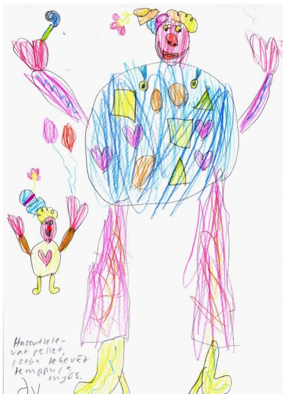
Figure 2: Melinda’s individual sketch, “Funny clowns that play tricks”.

The first two days of the learning process were used to brainstorm for different manifestations of humour. The first day entailed a discussion with the children about different kinds of jokes and funny situations, after which the children were assigned the task according to Piret’s (1941) instruction: “Draw a picture that would make other people laugh!” (see Figure 2). These drawings were supplemented by verbal narratives explaining the humorous features of the drawings.