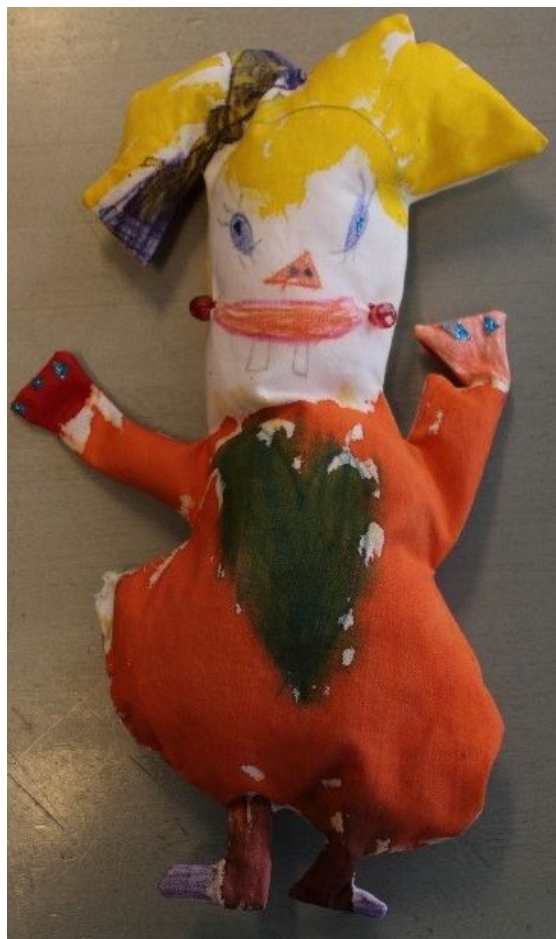
Figure 6: The soft toy made by Melinda.

Examples of funny clothes and incongruence are “men’s clothes on a woman”, “wearing pyjamas in the daytime” and “shoes that are too big”. Funny features such as “sticking-out ears” were painted on the faces. The figure designed by Betty is called Tutti Tulli (a form of word play like “Pacifier classifier”). According to the maker, the soft toy has several humorous features, such as short bow legs, a funny face with two teeth sticking out, clothes in amusing colours and a triangle for a nose (Figure 6).