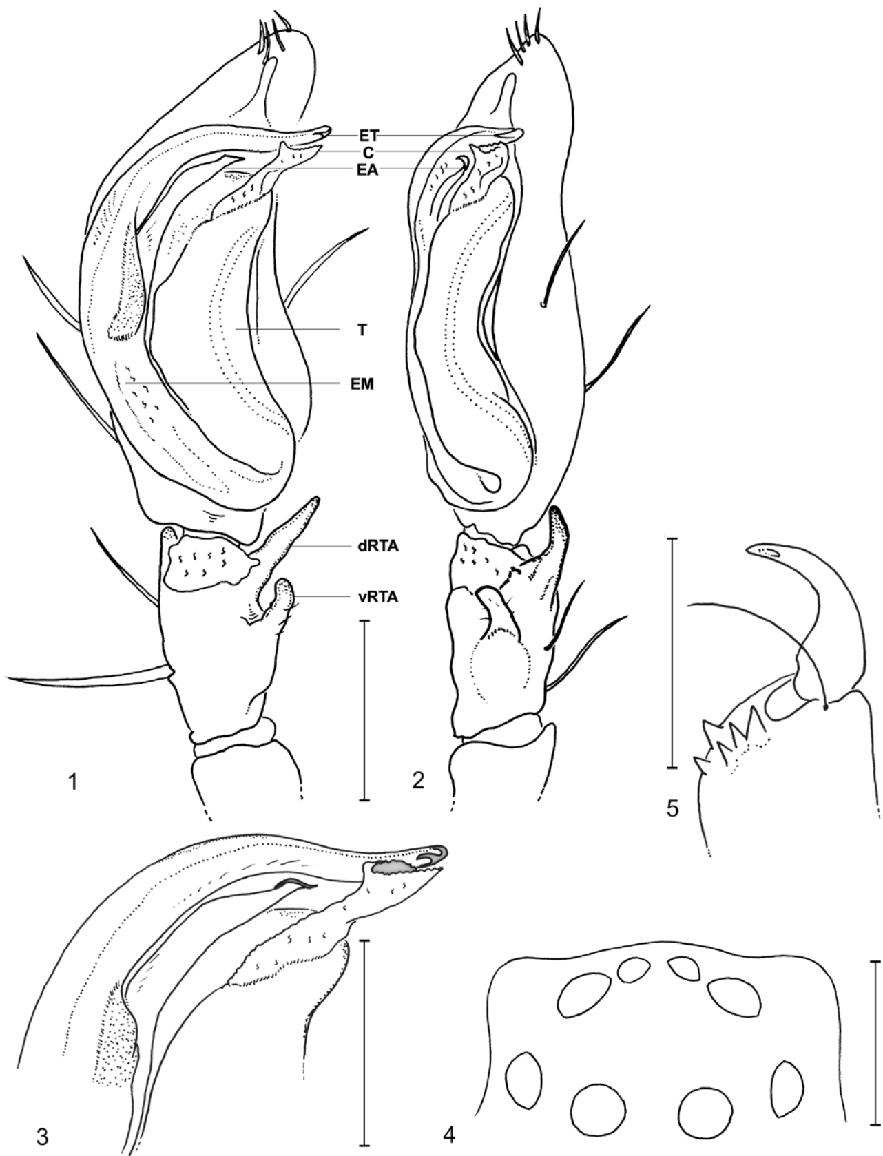
Figs 1-5. Pseudomicrommata mokranica sp. nov., male holotype, Iran. (1-2) Left palp, ventral and retrolateral views. (3) Distal part of tegulum, with embolus tip, embolic apophysis and conductor, ventral view. (4) Eye arrangement, dorsal view. (5) Left chelicera, ventral view. Scale bars = 1.0 mm.