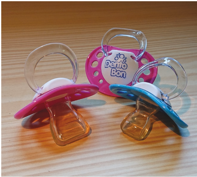
Figure 2. DentoBon study pacifiers.